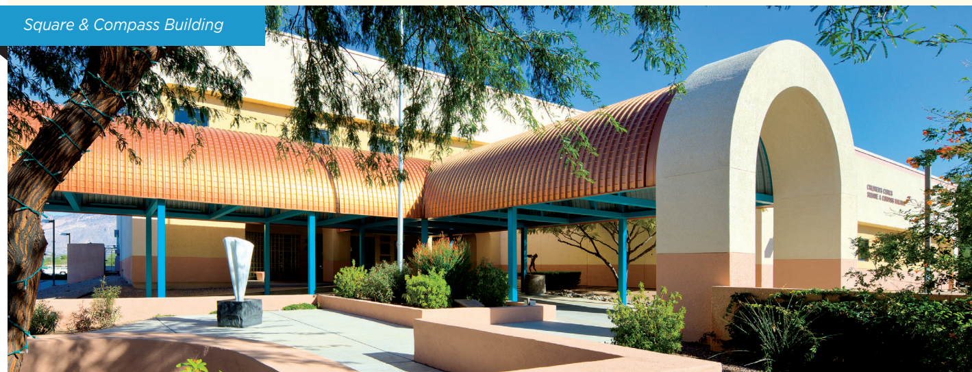
Square & Compass Building